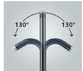
Precise motion for perfect control