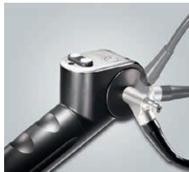
Ergonomic design for effortless use