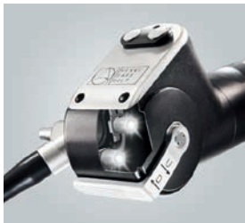
Integrated LED for optimal operating expense