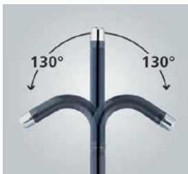
Precise motion for perfect control