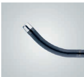
High durability for cost effectiveness