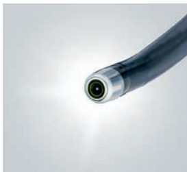
Outstanding optical quality for brilliant image